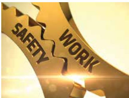
// SAFETY STEPS TO KNOW 7