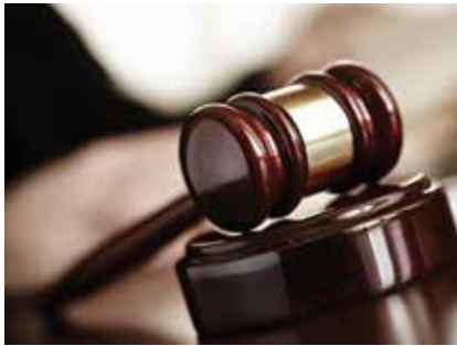
//LONG ARM OF THE CITY 2