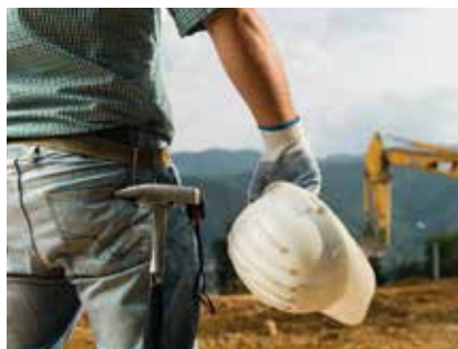
// JUST NO COMPARISON 20