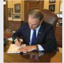
Governor Jay Inslee signs the Hirst fix bill.