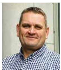
// AL AUDETTE

In 1990, the Washington state Supreme Court held in Stute v. PBMC a general contractor could be held li-