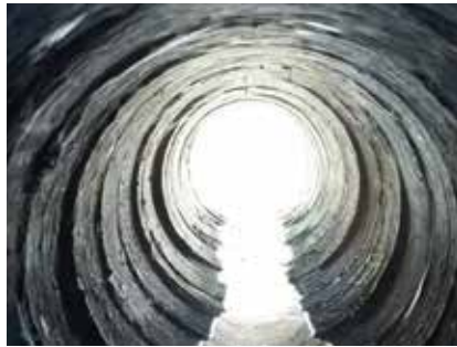
// CULVERTS CASE UPDATE 5