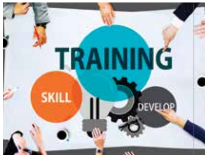
// SCHEDULE A CLASS 24