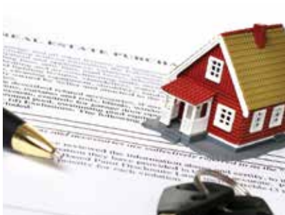
//SSB 6175 FALLOUT 22