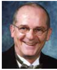
// ART CASTLE

GRANT WILL ALLOW BIAW TO DELIVER LID EDUCATION DIRECTLY TO BUILDERS, DEVELOPERS