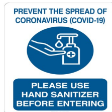
Hand Wash Signage Call for Price