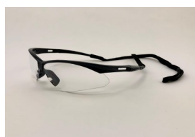
Neck Cord Glasses $4.29 ea