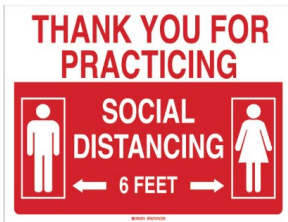
Social Distance Signage Call for Price