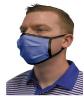
Cotton Facemask $5.90 ea

We're here to help you get back to work. And stay working.