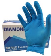
3 Mil Nitrile Gloves Call for Price