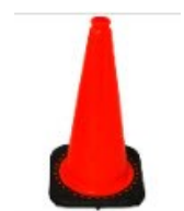
Wide Body Cone $8.28 ea