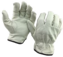
Gen Purpose Gloves $4.07 ea