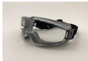
Lightweight Goggles $9.99 ea