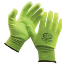
Polyurethane Palm Gloves $1.71 ea