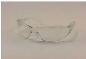
Anti-Fog Glasses $2.09 ea